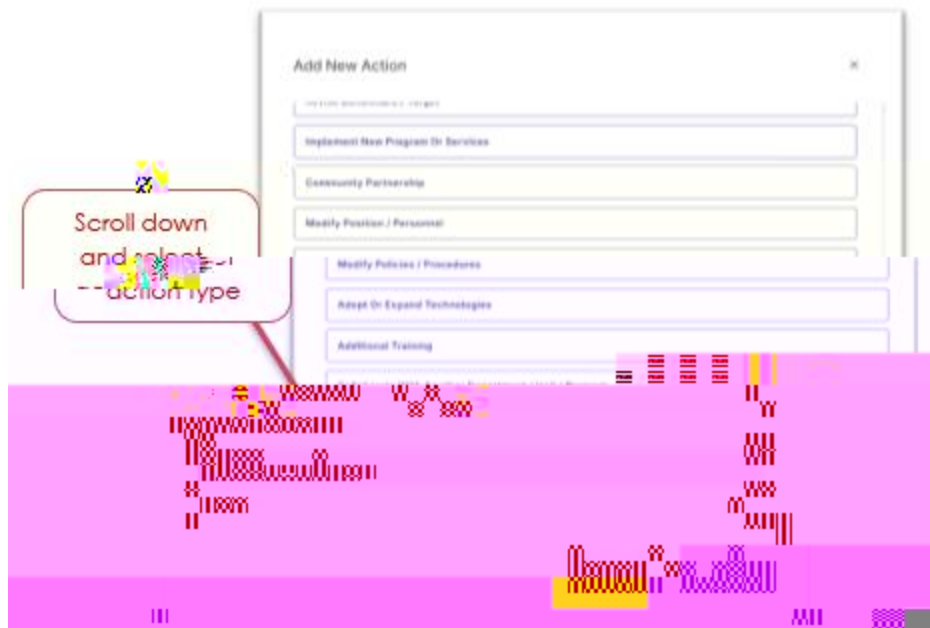
Figure 5: Select an action type "Maintain Assessment Strategy."

When you select an Action Type, a new window will open where you are