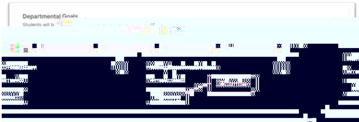
Figure 3: Accessing the "Measure" page for a specific measure.

To report this, click on the ADD RESULTS button under the measure. (See Figure 3.) This will take you to the "Measure" page for this measure.